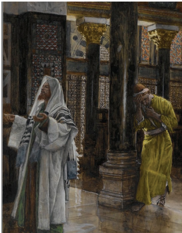
The Pharisee and The Tax Collector — James Tissot